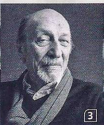
3. MILTON GLASER