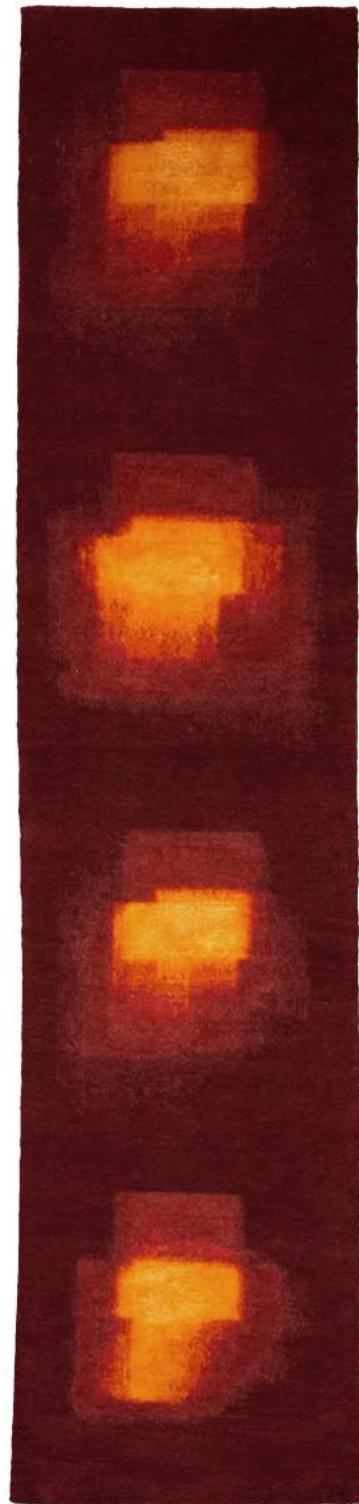
Radiance in TJ 2082 Burgundy wool/silk, 150 knot, 3mm